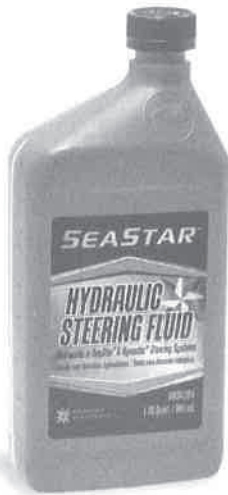
Figure 10-1. HA5430-1L, HA5440-1G, HA5458-5G.

ANY NON-APPROVED FLUID MAY CAUSE SERIOUS DAMAGE TO THE STEERING SYSTEM RESULTING IN POSSIBLE LOSS OF STEERING, CAUSING PROPERTY DAMAGE, PERSONAL INJURY AND/OR DEATH.